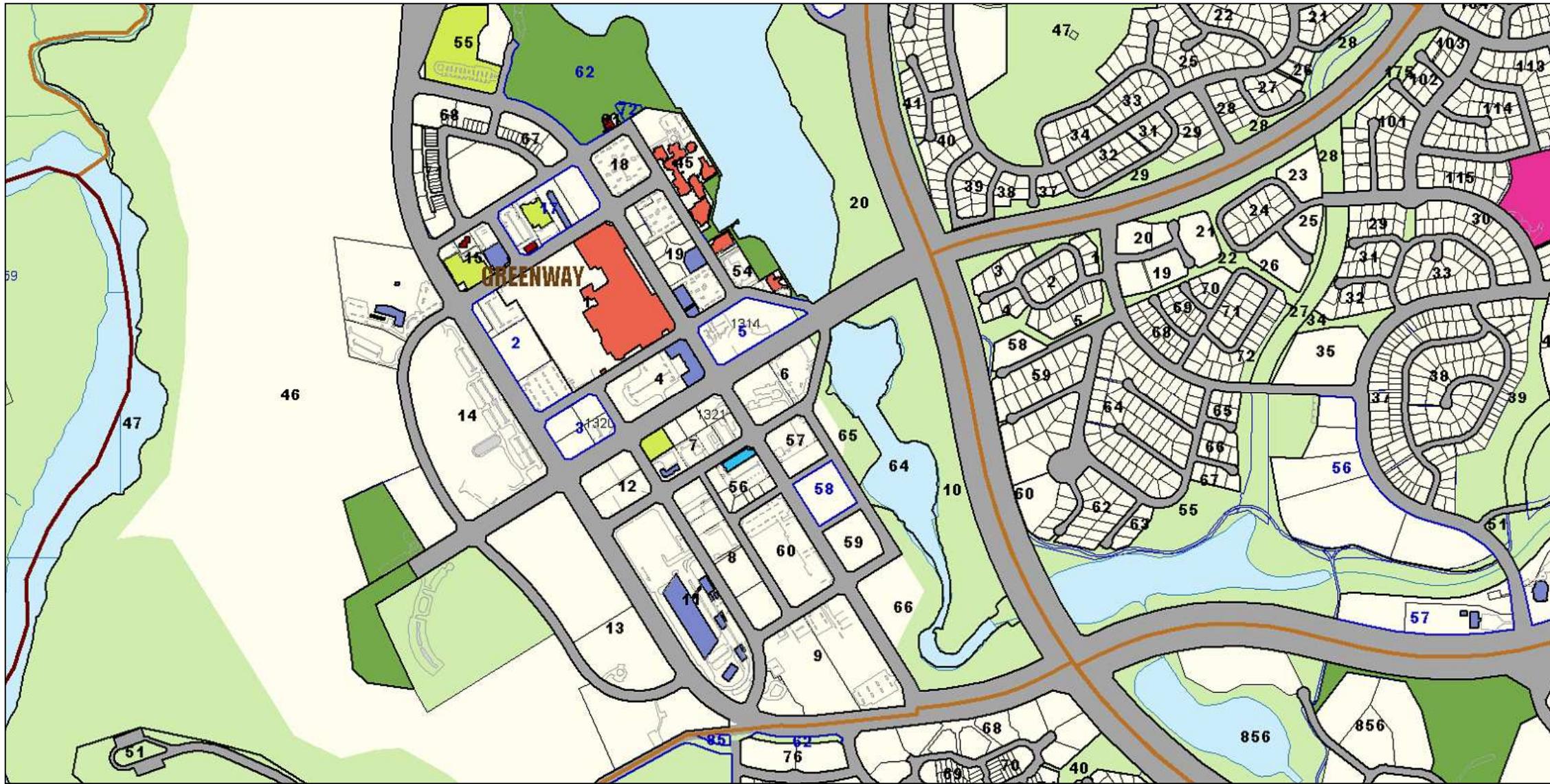
NB: The buildings shown in colour have a recreation, education or community focus. See Appendix 1 for a full list of the community facilities in Greenway and the Tuggeranong Town Centre.