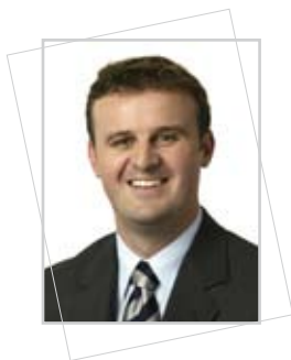
Andrew Barr MLA

Over the next few years the government aims to build on Canberra's unique heritage while ensuring this dream is kept alive.