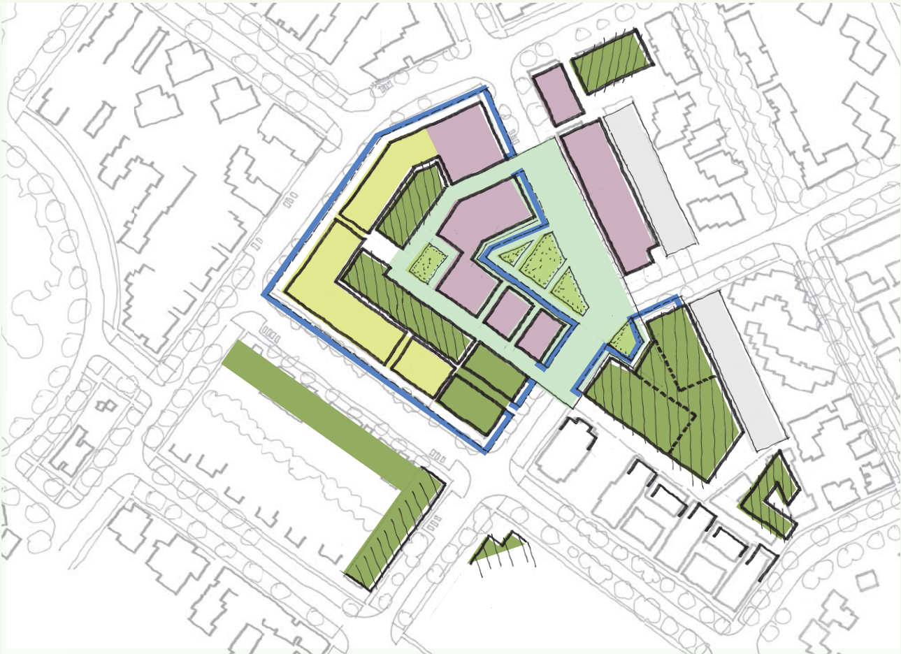
Figure A: Kingston Centre concept plan