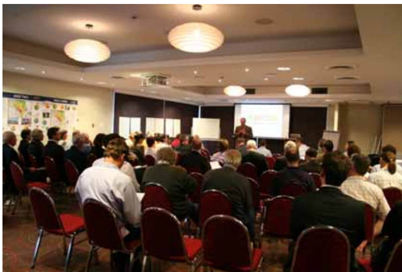
Question and answer session.

Following the presentations a question and answer session was held. Attendees were invited to ask questions of the panel to ensure they gained a solid understanding of the ideas before further discussions. Questions and responses are outlined at Appendix C. A series of related studies were also made available for review by attendees e.g. Railway Masterplan for the ACT (December 2009).