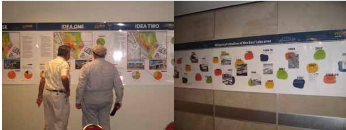
Community Information Session Displays

Approximately 80 members of the public attended the information session.