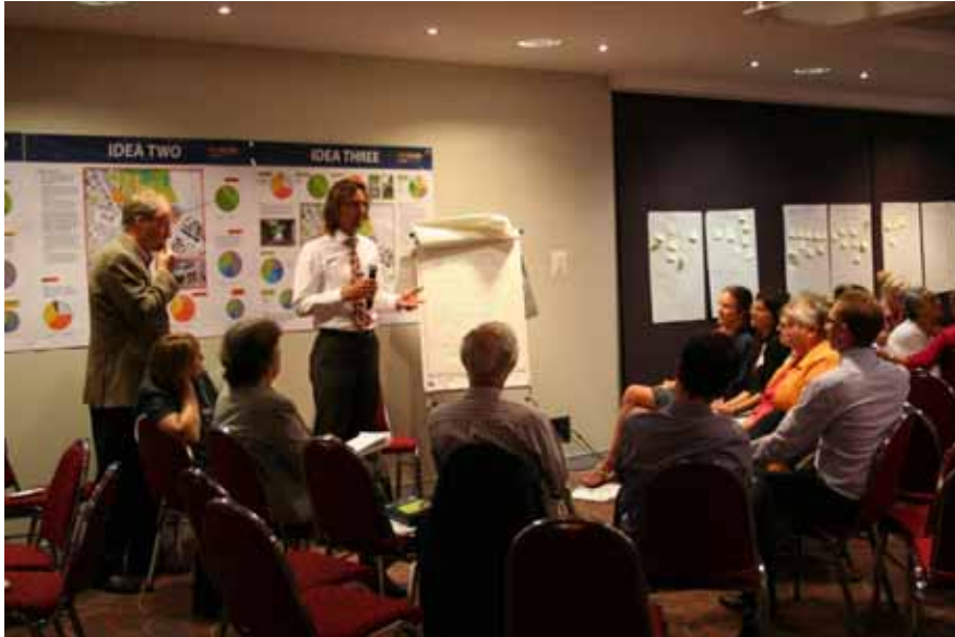
Small group discussions.

Small Groups - A series of small group workshops then allowed participants to describe and discuss their responses to the planning ideas in greater depth. Outcomes from each group were reported back to the forum. A record of the outcomes is at Appendix E.